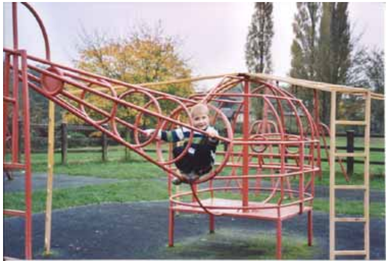
Helicopter Landing at Gray's Rec