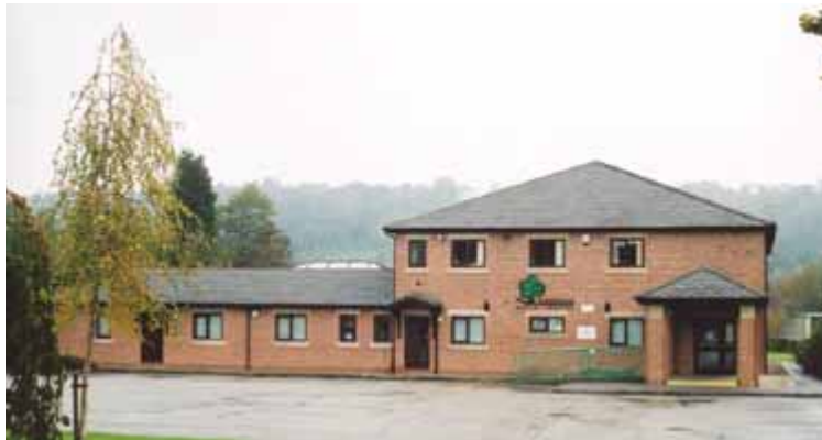
Appletree Medical Centre

park? It was supposedly built for the Community and many of us donated money, so why do they object to the car park being used out of hours?