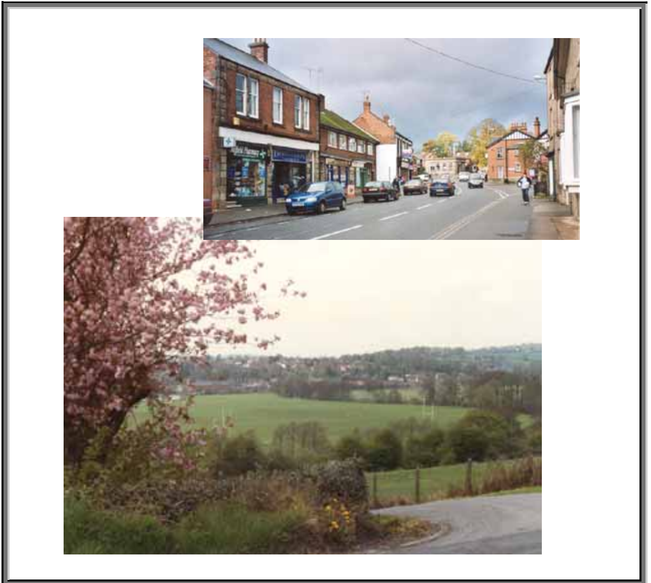
Town Street Duffield and Duffield seen from Duffield Bank

This document is available on the Parish Council website at www.duffieldpc.org.uk It is also available on free CD and in paper form from the Library on Wirksworth Road.