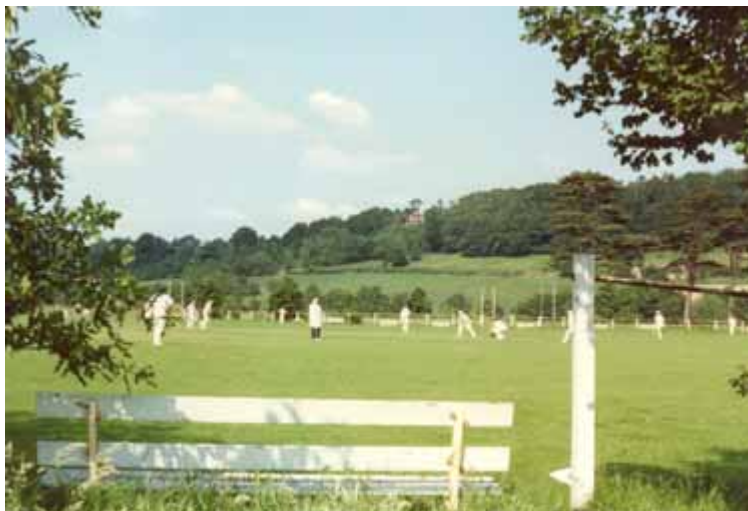
Sport on Eyes Meadow

The succeeding pages are the result of our enquiries and we set out the findings of the research, consultations and discussions. We hope that we have identified the issues which need to be tackled and the opportunities which could lead to action.