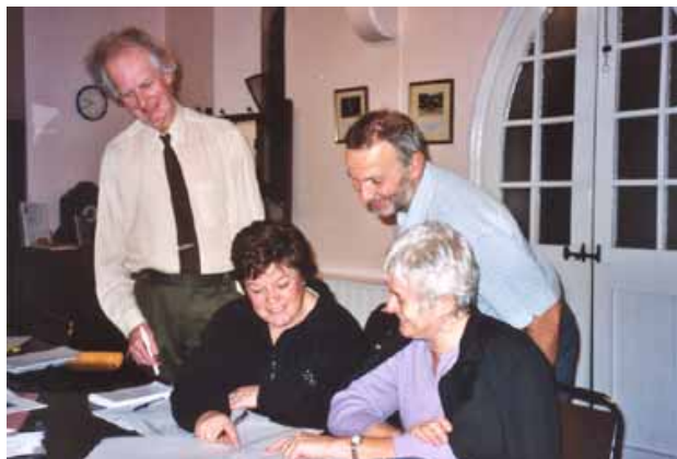
Some Members of the Steering Group October 2004

Duffield is a large urban village but the Parish Council considered that such a Plan would be helpful and that the best way to proceed was to see if enough people in the village were sufficiently interested to create an independent and actively minded committee to pursue the idea.