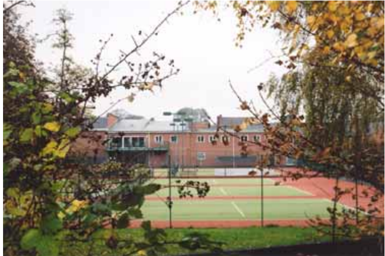
Duffield Tennis Club

School/people/environment are the strengths and play to these. We do have the Derbyshire, who are good employers.